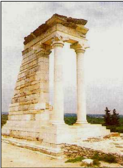
A postcard of the trade